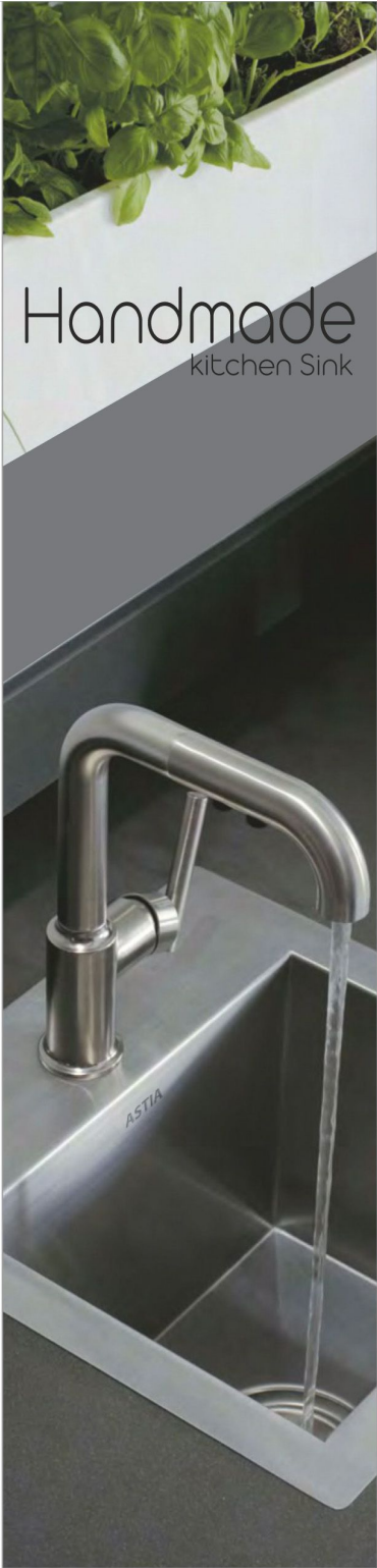
Handmade kitchen Sink