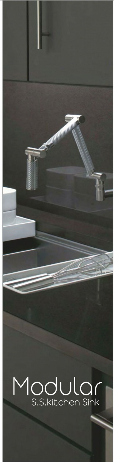
Modular S.S.kitchen Sink