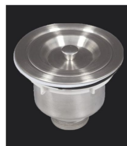
↑ PLASTIC BASKET COUPLING ↑